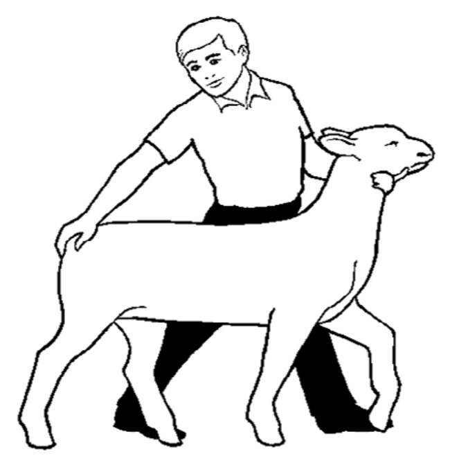
Figure 2. Lift the lamb's dock to encourage your lamb to walk.