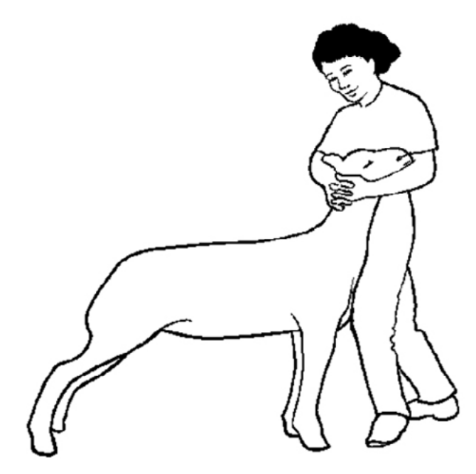
Figure 1. Drive your lamb by pushing back on its shoulder area with your knee or leg.

When the judge requests, stop the lamb for a side view. Set up the lamb as discussed earlier. Allow plenty of room between you and the lamb in front. This gives extra room to work around the front of the lamb and keeps the lamb behind from crowding you on the profile.