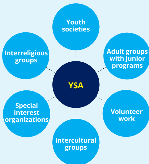
Figure 1. Web Chart.

Mississippi 4-H is a youth organization made up of Extension Agents, volunteers, and caring adults who utilize the 6 C's of Positive Youth Development to help young people develop the competencies for life-long success. While this publication is intended for adults working with young people in the 4-H youth development program, it applies to adults who work with youth across a variety of programs.