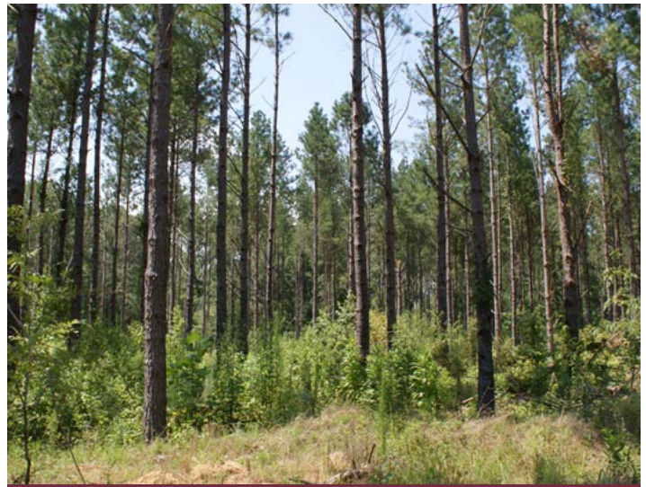
Figure 12. Timber stand improvement includes tree injection to remove undesirable hardwood species on an individual basis.