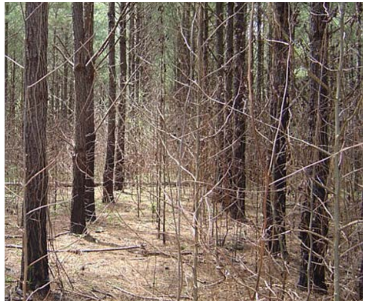
Figure 14. Selective herbicides sprayed in a plantation after its first thinning killed these midstory hardwoods, releasing the pines to fully use site resources.