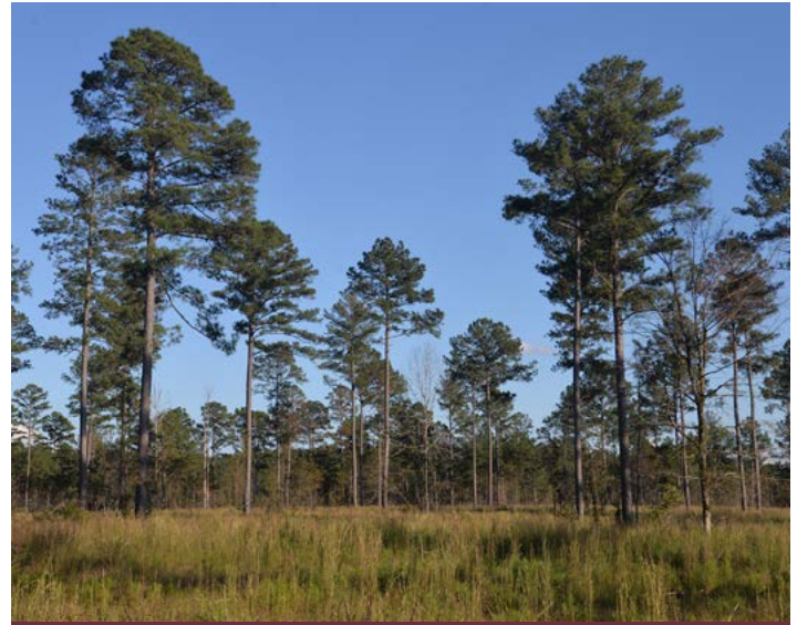
Figure 10. A seed tree harvest leaves regularly spaced trees to provide seed for growing the next forest.

Other options for even-aged management use natural regeneration through seed tree (Figure 10) and shelterwood systems. With these methods, most of the timber is harvested, but some uniformly spaced trees are left behind as a seed source from which to regenerate the stand. The difference between seed tree and shelterwood is the number of seed trees retained. With seed tree regeneration, about 4 to 15 trees per acre are left. With shelterwood, greater numbers of seed trees are left depending upon management goals. The tree species to be regenerated determines which method is more appropriate. For instance, seed tree is adequate for loblolly pine, and shelterwood is better for oak species.