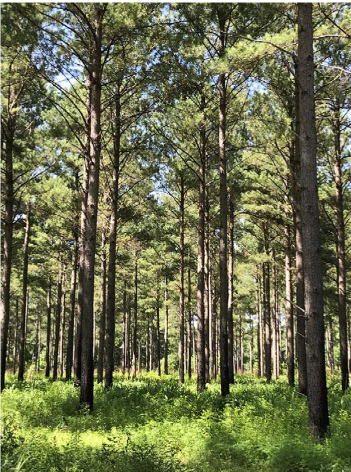
Figure 6. Proper vegetation management in a pine forest includes the use of selective herbicides and prescribed fire to encourage ground vegetation to grow. This type of low-growing vegetation could support a deer through the summer.

Certainly, periodic burning reduces the fuel load. As Native Americans understood, fire improves access through the woods by managing vegetation. Low-growing species are easier to walk through than thick, midstory vegetation. Prescribed burning can encourage regeneration of southern yellow pines and upland oaks. Finally, prescribed fire promotes wildlife habitat by setting back successional stages to ground vegetation. Having more low-growing vegetation provides food and cover to a variety of wildlife, including deer, rabbits, and turkey (Figure 6).