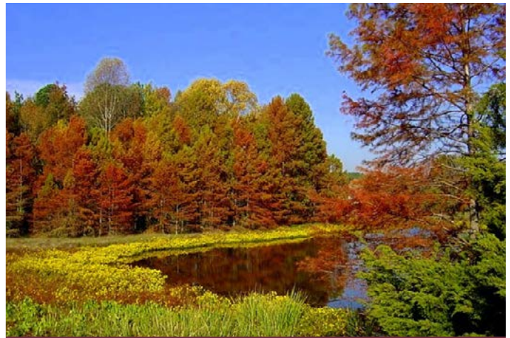
Figure 3. Forests are communities of many plants and animals interacting with the environment and living together, ecologically supporting one another.

Prescribed burning in Southern forests has many beneficial uses (Figure 5).