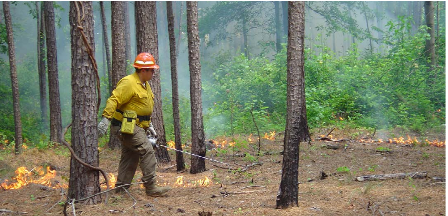
Figure 5. Southern pine forests are adapted to periodic, low-intensity fire. Here, a Mississippi Forestry Commission technician sets a prescribed backing fire in strips.