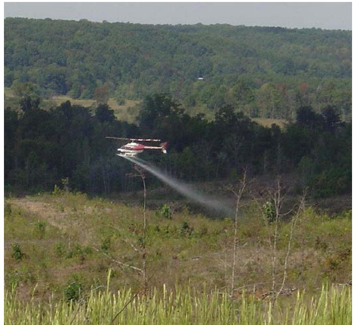
Figure 8. Herbicides are sprayed during site preparation to kill all unwanted vegetation on a site before planting trees.

One forester may be concerned with harvesting trees, while another plans and supervises the forest regeneration. Professional foresters deal with problems concerning trees, soils, watersheds, rangelands, wildlife, and recreation. Others become administrators, resource managers, researchers, or educators to manage, better understand, and teach others proper forest stewardship.