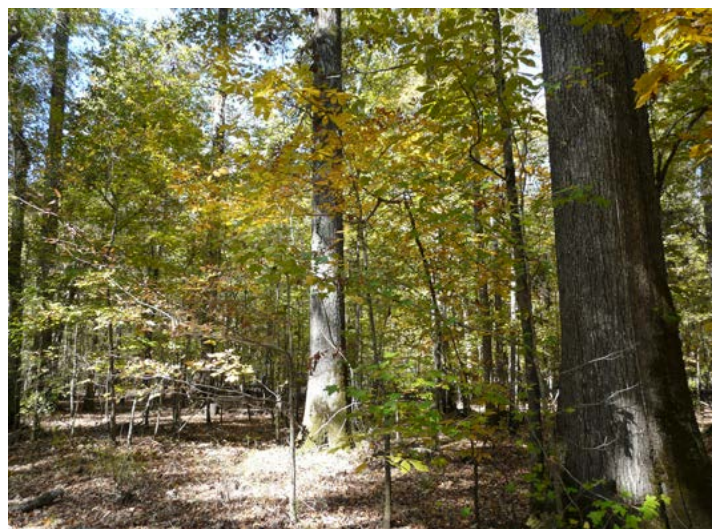
Figure 4. (top left) Periodic prescribed fire helps maintain early successional stages dominated by low-growing vegetation such as grasses and forbs. (top right) Pioneer trees and shrubs become established in open areas, gradually dominating the ground vegetation. (bottom) As pioneer tree species mature, other tree species become established in their shade, gradually changing the nature of the forest. Shown here is a later successional stage of bottomland hardwoods containing multiple species of oak, hickory, maple, and gum.