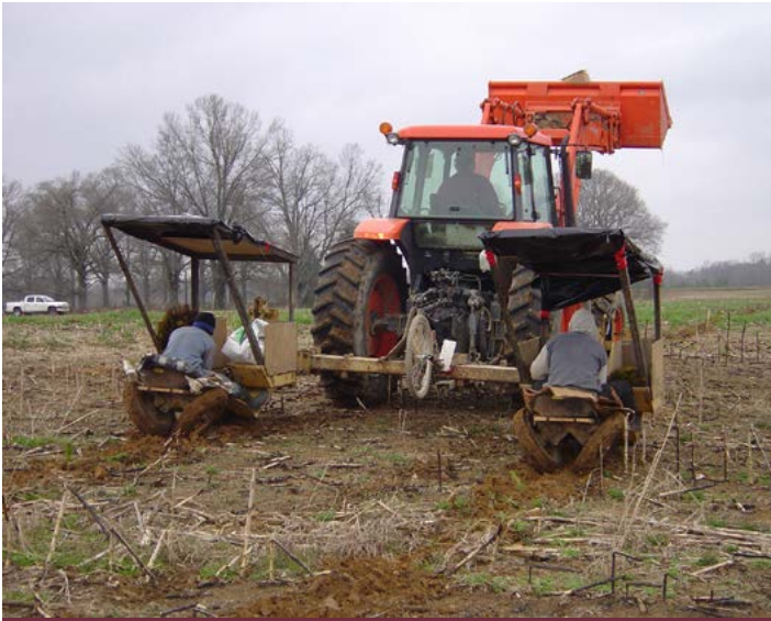
Figure 9. In artificial regeneration, trees are planted after the site has been prepared.