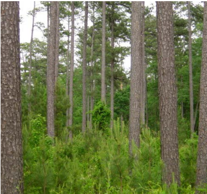
Figure 7. In uneven-aged forest management, periodic partial harvests maintain a forest structure with all age and size classes.