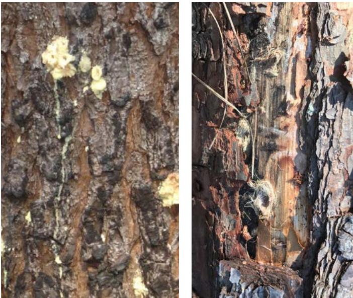
Figure 13. Overcrowding of pine trees can stress the stand, leading to insect attack by bark beetles (left) or deodar weevils (right).