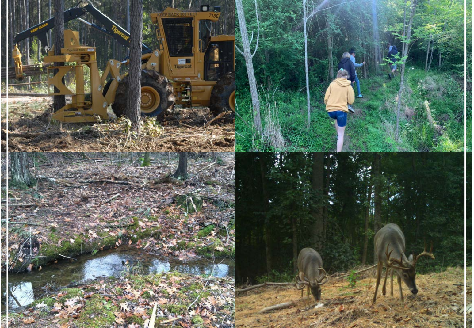
Figure 1. Forests provide many uses and amenities. (top left) A feller-buncher harvests trees. Wood from the tree trunk will be processed into a variety of wood products. (top right) Forests provide opportunities for recreation. (bottom right) Wildlife, like these white-tailed deer, use forests to find food and cover. (bottom left) Forests protect soil from erosion and filter sediments to keep water clean. Forests also provide many other ecosystem services, such as producing oxygen and storing carbon.