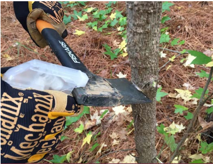
Figure 11. Thinning in a pine forest improves stand growth, forest health, and overall stand quality by retaining the best trees for final harvest.